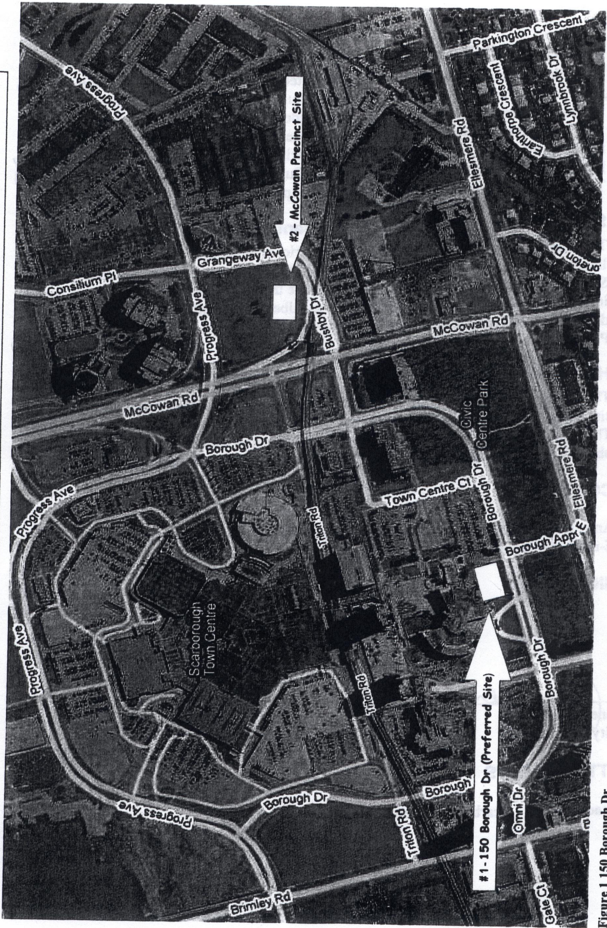
Figure 1 150 Borough Dr.